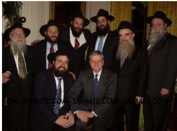
White House Chief of Staff, Joshua Bolton